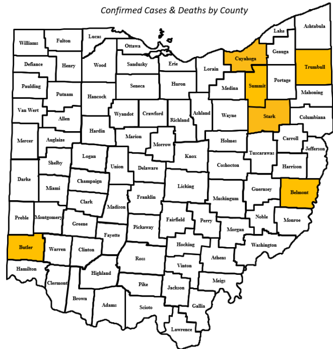
Confirmed Cases & Deaths by County

COVID-19 numbers provided by ODH daily at 2:00 PM